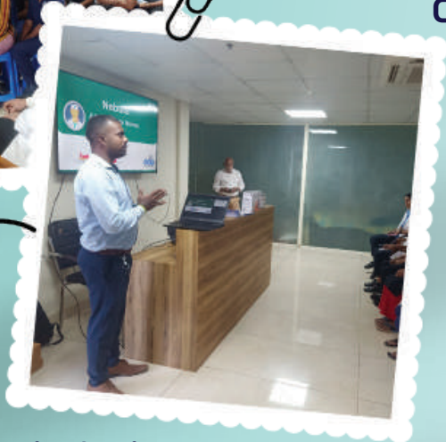
Knowledge in Action: Training Our Nurses