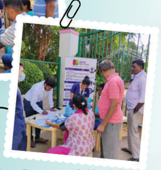
Building Stronger & Healthy Communities Together